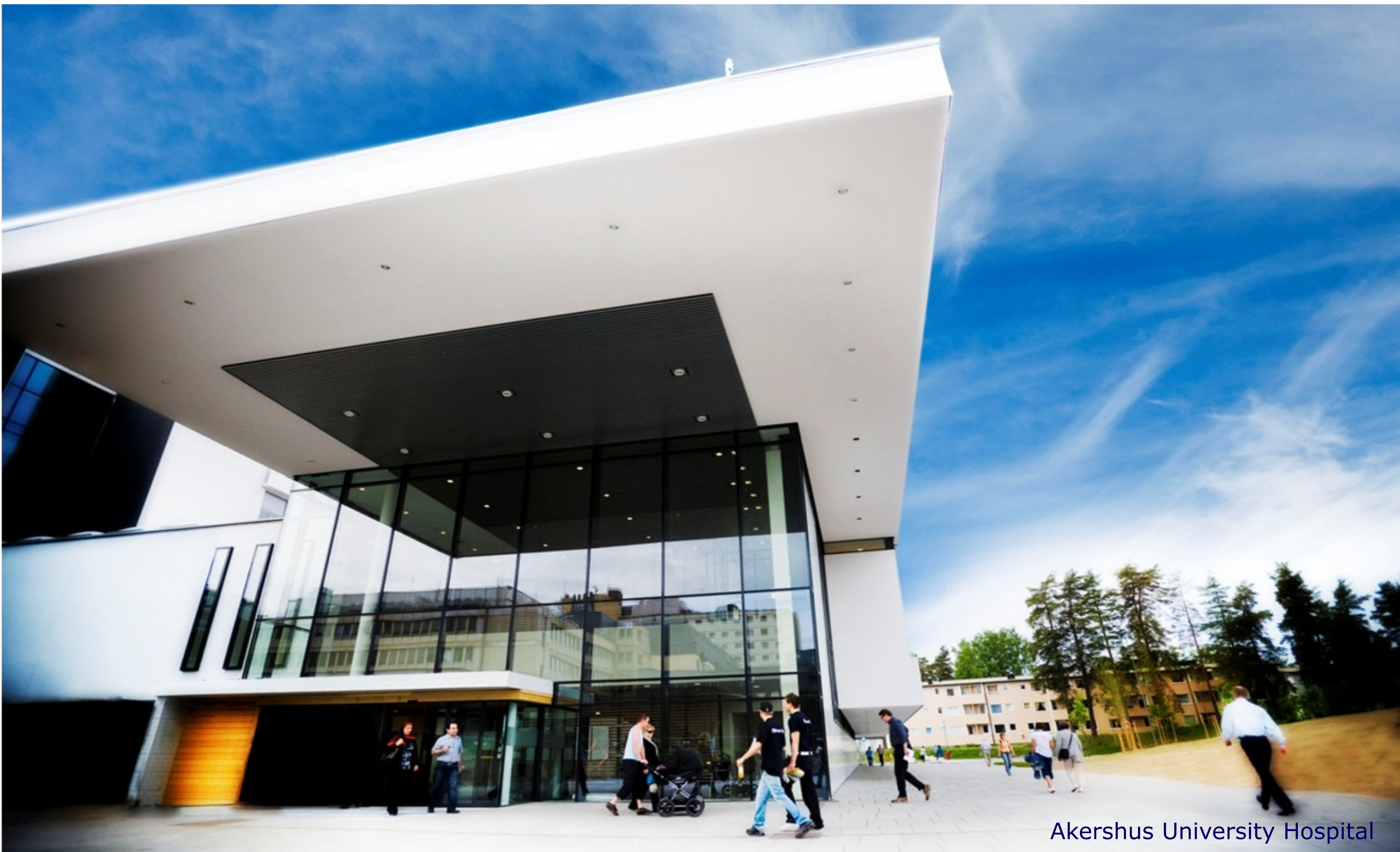
Akershus University Hospital

23 rd International Conference of the European Federation for Medical Informatics